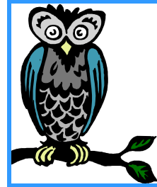
The Wise Old Owl

I hope Santa Claus was kind to you and bought you all those new computerized gadgets you have been hoping to have one day. Maybe it was a new computer, printer, scanner, digital camera, DVD player, Plasma TV (the flat wall mounted ones) or a broadband internet connection. What ever new toy we receive will bring with it a new learning experience and some new names for features and things we have never heard of before. We may be able to help you through your "hour of need" as you come to grips with your new exciting toy. We may have members who have become quite knowledgeable about a toy similar to the one you got this Christmas.